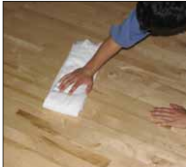
Preventing Floor Stains

For all civic and non-sporting events, Tarkett Sports recommends the use of Protectile as a wood flooring protection system. Please contact your Tarkett Sports representative for more information about how to obtain Tarkett Sports' Protectile floor protection.