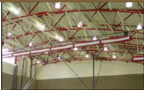
Humidity Ventilation Air Circulation