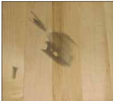
Removal of Shoe Marks