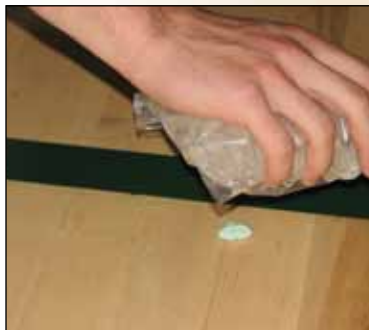
Gum and Tar Removal