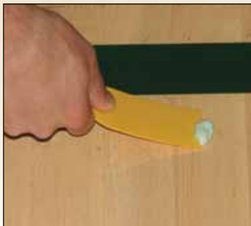
Gum and Tar Removal