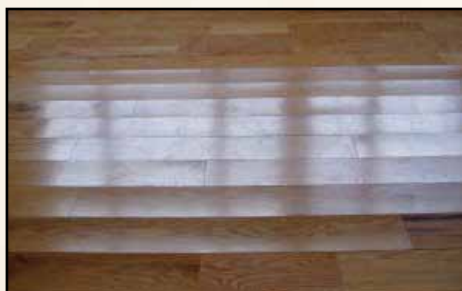
Cupping and Water Damage